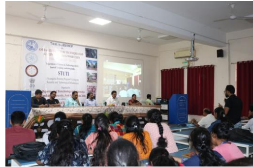
Taking Feedback from students