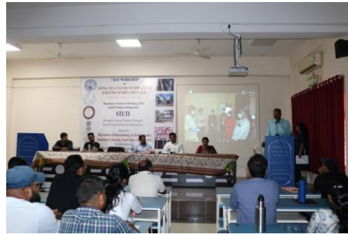
Valedictory function and Certificate distribution