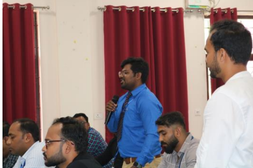
Self Introduction of participants