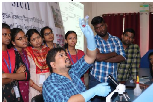
Demonstration of animal cell subculturing