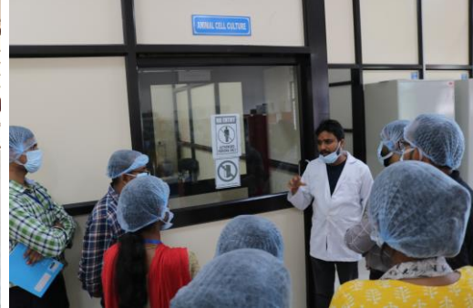
Visit to all laboratory facilities