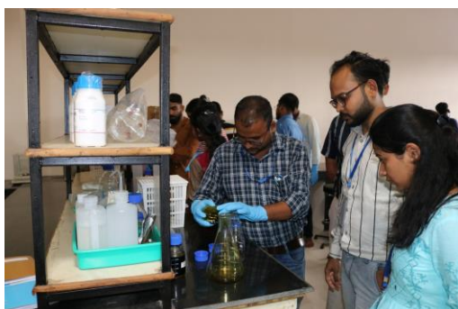
Preparation for Media by participants