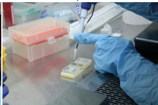
Subculturing, counting and seeding of cells by participants