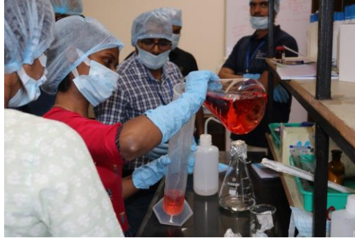
Media preparation by participants