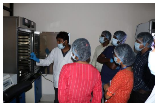
Explanation of working principle of equipments