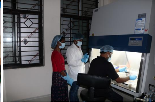
Media Filtration and Cell revival by participants