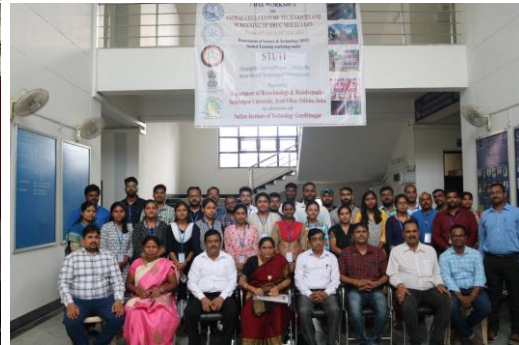
Group of participants and Trainers