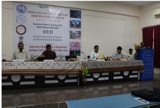
Inaugural Session with Honourable Vice Chancellor